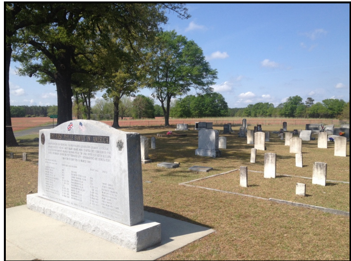
Peelle Cemetery 2017

For more information on the monument you can see Lawrence Etc., Volume 9, Issue 3, when the Norton family restored the paint on the monument back in 2009 or go to the web site to see it when it was erected. It is also in the Peelle Chronicles .