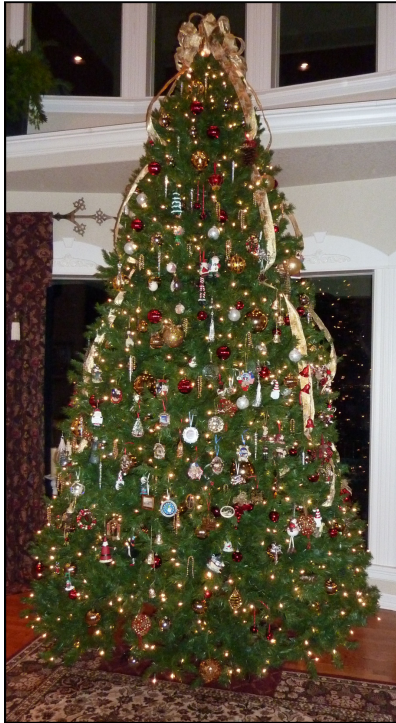
Our 2010 Christmas Tree 14 Feet – 4500 Lights

Those who don't remember their ancestors don't deserve to be remembered!